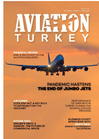
@ Issue #6