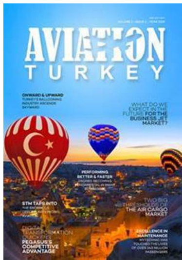
@ Issue #2