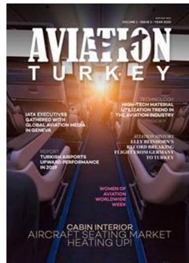
@ Issue #3