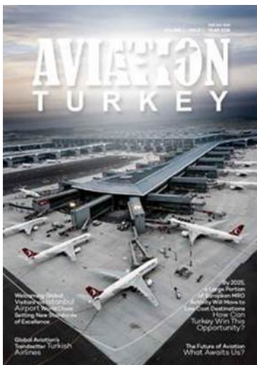
@ Issue #1